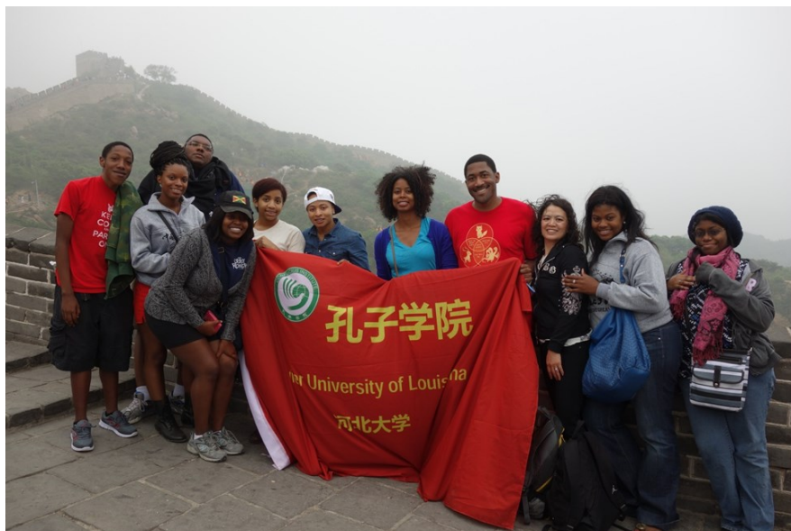
Xavier's Confucius Institute students, faculty and staff tour the Great Wall of China.