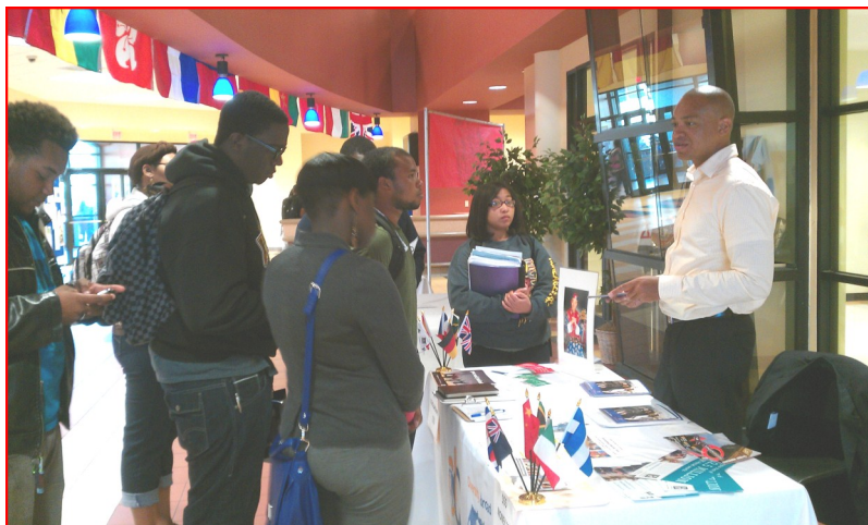
Xavier students discuss Study Abroad options with a representative from Diversityabroad.org during the annual Study Abroad Fair in the Univ. Center

January 23, 2013 marked Xavier's annual Study Abroad Fair, which brought representatives from twenty Study Abroad providers to campus. Among those represented were third party providers, foreign language schools, and study abroad scholarship providers. Students learned about the many opportunities to study abroad through summer, semester, and academic year programs. Students also gathered information about faculty-led summer courses, which will take place in Ireland, Greece, and Turkey. In addition to third-party programs and faculty-led summer courses, Xavier's own Confucius Institute offered information about studying Mandarin abroad during the summer of 2013.